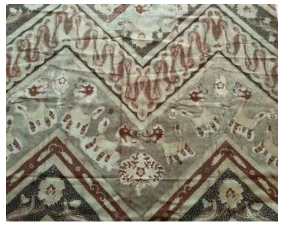
Figure 1. Classic Warak Parang Batik Motif

Motive Title: Classic Warak Parang Batik Size: 200 * 110cm (short sleeve shirt) Media: Mori Primisima Fabric Color: Mangrove (brown) Technique: Combination Batik Production Years: 2006-2010, 2018-2019 Price: Rp. 350,000.00, -