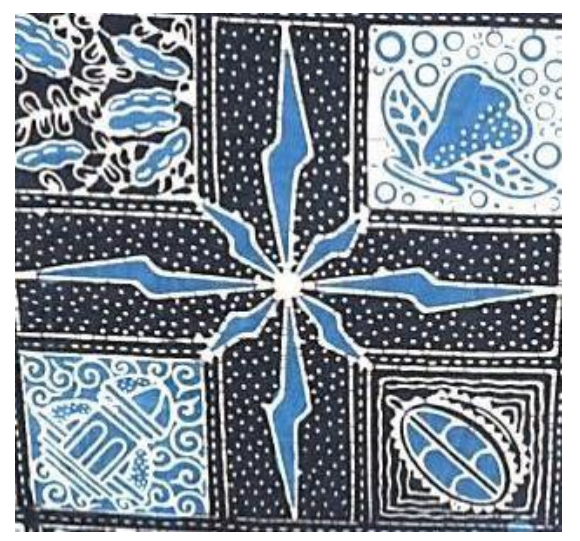
Figure 2. The Indonesian Batik Motif Power

The classic Warak Parang batik motif is a motif derived from the idea of the Semarang city icon, the warak ngendog. Warak ngendog in the city of Semarang is a children's toy in the form of an animal with a characteristic head that resembles a dragon head typical of Chinese ethnic culture, its body is shaped like a camel depicting Arab ethnicity, and has four legs resembling a goat typical of Javanese ethnic culture. According to Sri Iswidayati (2015), the motif that is easy to know in this classification is geometry and non-geometric motifs in this motif is a geometric motif whose position is drawn diagonally on the cloth. The parang motif consists of two parts, namely the gareng (arch) and also the mlinjon (a rhombus shape that is at each end of the gareng). Ramadhan, 2013: 86).