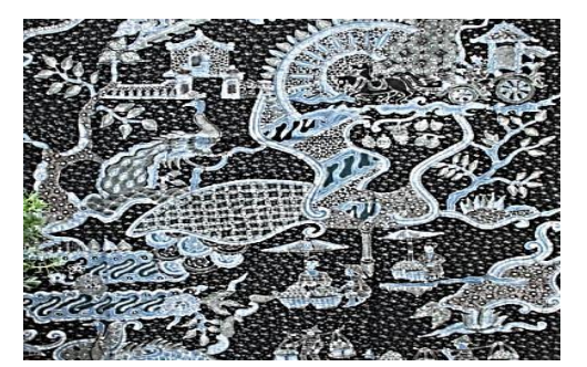
Figure 3. The Pragulopathic Legend Batik Motif

Indonesia Power beautifies the appearance of Zie Batik's batik motifs.