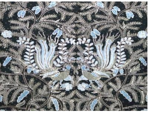
Figure 4. Asem Purnomo's motif

The batik motif of the Pragulopati legend is a batik motif that depicts the history of the Gunungpati area. The local people say that long ago there was a man named Pragulopati who was a prince, he was someone who named the area after Gunungpati.