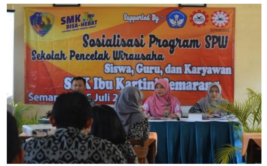
Figure 7. Socialization of School of Entrepreneurship Program