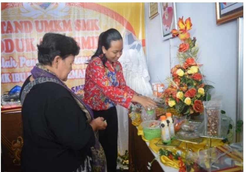
Figure 5. Entrepreneurship Activity of The Member of School of Entrepreneurship

Further evaluation for the School of Entrepreneurship program is conducted by compiling the initial report of the program which includes the implementation report information sheet, entrepreneurship development program, type of business, background, goals, expected results, implementation and results of activities. The implementation of the preparation of the initial report of the School of Entrepreneurship program at the Vocational High School has been carried out well in accordance with the schedule of reporting agenda determined by the Directorate of Vocational Education Development. The results of the study of documents, observations and interviews conducted by researchers note that planning and implementation of the initial report of the School of Entrepreneurship program can be seen that planning has been carried out at the beginning of the program.