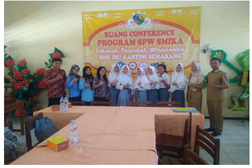
Figure 4. School of Entrepreneurship Conference Room

The results of the study of documents, observations and interviews conducted by researchers show that the facilities and infrastructure of the School of Entrepreneurship program in vocational schools are incomplete. Vocational Schools that carry out this program have inadequate infrastructure, starting from the School of Entrepreneurship implementation room, the School of Entrepreneurship selling place, School of Entrepreneurship exhibition equipment, teleconference room and so on. A solution is needed from the Directorate of Vocational Education Development so that its assistance can improve the condition of the existing infrastructure.