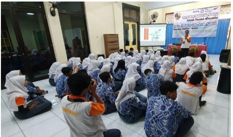
Figure 3. Workshops for HR Enhancement of the School of Entrepreneurship Team

Human resources in the School of Entrepreneurship program at Vocational Schools include supervisors and students as School of Entrepreneurship members. The supervising teacher has sufficiently fulfilled the criteria as an instructor who has experience in the business world and has an independent business outside teaching hours at school. There are still some students who do not meet the criteria as School of Entrepreneurship members because there are still some students who do not have any business when joining this program.