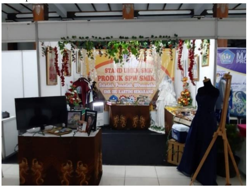
Figure 6. Exhibition of School of Entrepreneurship Products