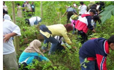
Figure 2. Village Cleaning Activity

se Society of Purbalingga, Cap Go Meh was celebrated only in the sphere of family and home, but after the Chinese Society of Purbalingga was established, the tradition was celebrated openly even to tourist so that not only the Chinese but also people of Purbalingga can feel its presence. (Fitriyani, 2012)