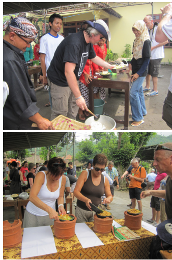
Figure 3. Cooking together tourists and local people

traditional foods and then joint the competition. This activities encourage people to always keep "guyub"/togetherness.