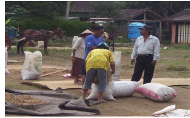
Figure 1. Harvesting Activities

Such kind of relationship also happened in Purbalingga where Chinese Society hand in hand tried to preserve Chinese culture, especially the tradition of Cap Go Meh. Before the establishment of the Chinese