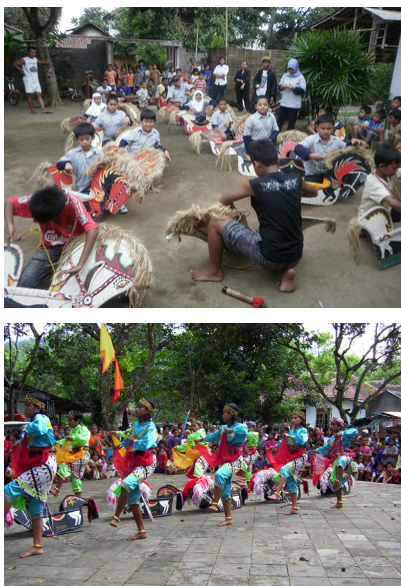
Figure 4. Tourists and local people exercised Traditional Dancing together

In figure 4 shown how people work together and hand in hand to held traditional performance in order to satisfied tourists especially international tourists. In the hand of Tourism Village Cooperative, people were organized to give optimal performance to entertain tourists. Candirejo Tourism Village Cooperative manage the tourism industries as their own enterprises that could