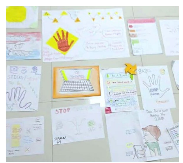
Figure 1. Campaign Design of Cyberbullying

There is documentation of training. At the end of the session, participants were instructed to design a campaign to prevent cyberbullying. They were provided with stationery to design the campaign—some documentation of the campaigns presented in Figure 1.