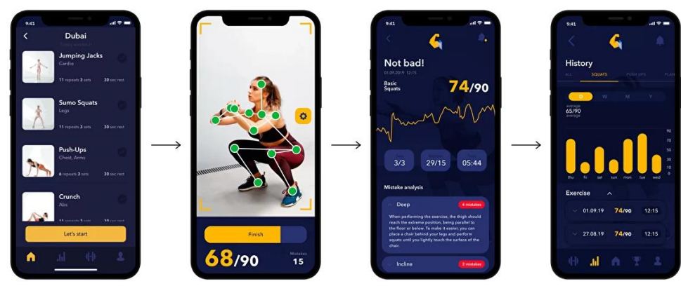
Figure 7. ArtiFit

ArtiFit is an intelligent computer vision fitness assistant for tracking exercise techniques that automatically recognizes the movements of 20 of the human body's major joints. Using the user's smartphone camera in realtime, the app offers corrections for up to five exercise joints per pose. (More than 80% of the most frequent errors) If a user makes an error, they will be instructed on how to exercise correctly. Simultaneously, the user can control themselves using real-time augmented reality images of their body. On the smartphone's display. ArtiFit will automatically edit and display the exercise duration, number of repetitions, score of overall exercise efficiency, and common errors by analyzing the user's exercise results. The membership fee is approximately $5 per month. [18].