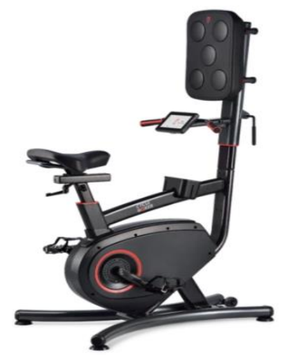
Figure 4 . CYCLE BOXER - Upright Bike with Boxing Pad