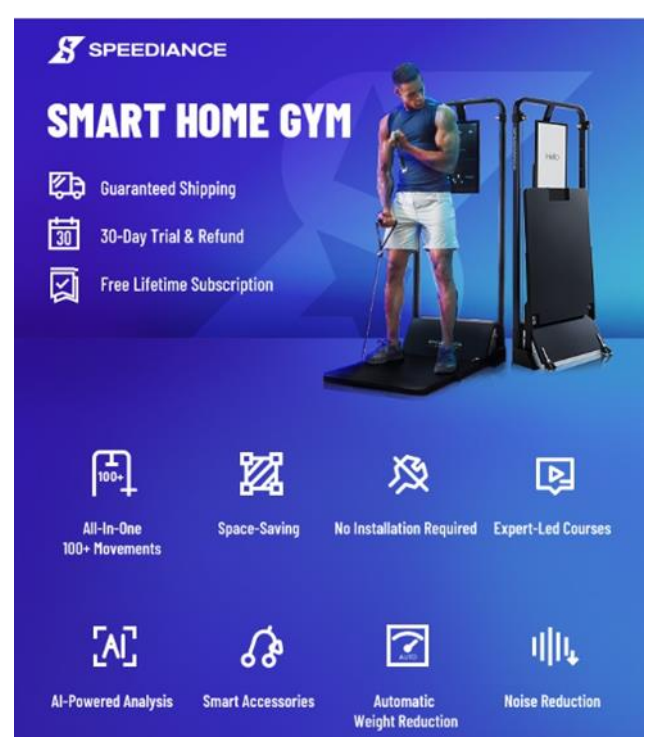
Figure 5. Speediance: Personal All-In-One Home Gym & Workout Coach

Speediance is an all-in-one home gym designed for individuals who wish to train in the comfort of their own homes. Utilizing artificial intelligence to reduce unique gym visits with a design centred on technology (AI). This optimizes both training and the type of motion. The 21.5-inch touchscreen interface enables users to concentrate on their workout. Users can select from over a hundred distinct movements, in addition to automatic shock and noise reduction. Which is compact and suitable for placement within the home. The price is approximately $559112. [16].