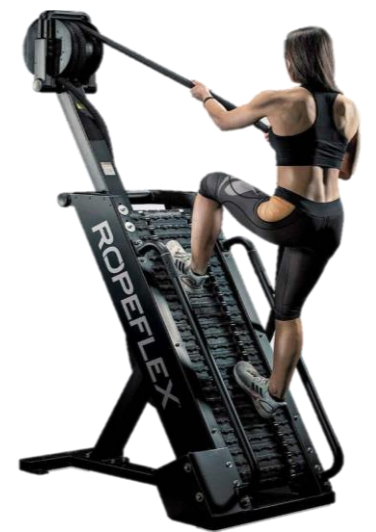
Figure 3. The Ropeflex APEX RX4400 Tread Climbing Rope Machine is Intense

The Ropeflex APEX RX4400 tread climbing rope machine is a novel piece of training equipment that will enable athletes to engage in an analog activity with greater professionalism. The machine has an integrated rope that the athlete must climb, while the integrated vertical treadmill track provides a portion for them to pedal while moving in place. The modular design of the exercise equipment will enable consumers to use each component separately for a customized workout. The resistance on the Ropeflex APEX RX4400 tread climbing rope machine is adjustable between 40 and 250 pounds, and its commercial-grade construction allows it to be used in public gyms. The cost is approximately $7,261.35 . [14].