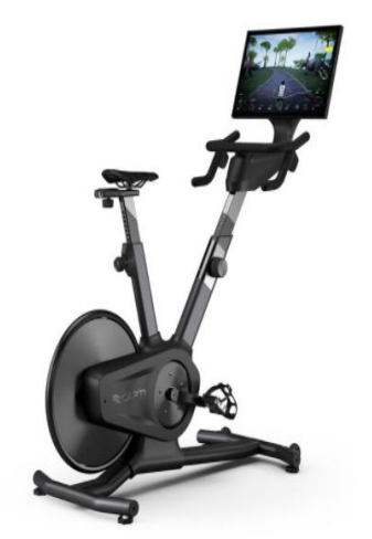
Figure 2. Capti launches new 'game-changing' smart bike