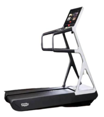
Figure 1. Compact

A treadmill with a refined and compact design, an adaptive running surface, and tablet-based custom training sessions. This is high-tech exercise equipment for users who want to train quietly at home without disturbing neighbors, such as a treadmill with a motor-driven drive system. This makes it possible to practice without disturbing others early in the morning or late at night. This exercise machine connects to a virtual trainer via a 21.5-inch display. Which can select required programs. Including the following features: personalized training from a tablet, Technogym session, Technogym routines, Technogym Outdoor, Technogym music playlist, Treadmill running biofeedback, and running improvement. It features built-in speakers that enable users to connect their devices to the system to play music or stream content. Shock absorbers are incorporated into the running surface to increase comfort and prevent injuries. The monthly cost is approximately $1,345.77, or $16,298.78 annually. [12].