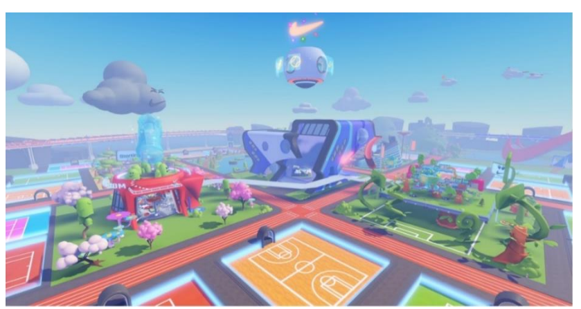
Figure 8. NIKELAND Metaverse

Nike and Roblox (an online gaming platform) have collaborated to create a virtual world called "NIKELAND." The game "The Floor is Lava" was derived from tag and dodgeball. These games were modeled after the company's Beaverton, Oregon headquarters. Comparable to world-class athletic competitions such as the World Cup and the Super Bowl, the time between games resembles these events. Nike has stated that it will continue to incorporate its athletes and products into the virtual world. Additionally, users can enter a virtual fitting room to virtually try on Nike apparel. The NIKELAND website is currently promoting special items such as headwear and backpacks [19], regardless of whether they are the most recent or newest versions.