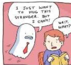
Figure 9. Episode 13

The first subsystem of judgment is capacity, which deals with their capabilities. The example of positive capacity can be shown as follows.