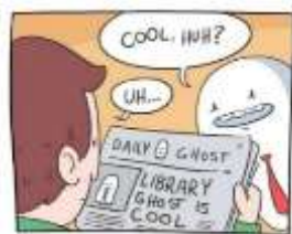
Figure 3. Episode 38

The second subsystem of affect is in/security. The examples on in/security in the library ghost webtoon can be seen as follows: