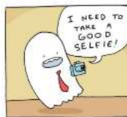
Figure 16. Episode 15

The second subsystem is valuation. Valuation is related to cognition (our considered opinions), Martin & White (2005), and the example of positive valuation.