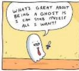
Figure 10. Episode 11