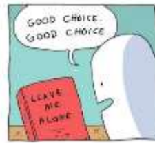
Figure 14. Episode 2

The first subsystem of appreciation is a reaction. Furthermore, the example of a positive reaction.