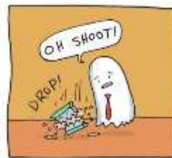
Figure 15. Episode 4

The context above indicated a (+) reaction of appreciation. It showed positive appreciation when the library ghost appreciated the book she was reading about.