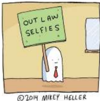
Figure 17. Episode 15

The example above indicates a (+) valuation of appreciation. The context expresses that the library ghost needs a good selfie (good value) from him, which means it is wanted or approved by the library ghost.