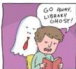
Figure 6. Episode 10