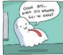
Figure 4. Episode 40

interpreted as an imposing feeling and saying that the library's ghost is capable of this. Furthermore, using "cool," the speaker reveals a positive feeling of (+) In/security .