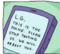
Figure 5. Episode 10

The third subsystem of affect is dis/desire. It can be seen that there are both positive and negative desires. The instance of desire is displayed as follows: