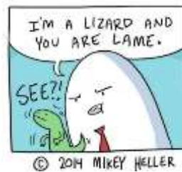
Figure 13. Episode 48

The last subsystem of judgment is propriety, which relates to how ethical someone is. An example of propriety can be seen as follows: