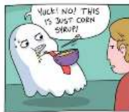
Figure 8. Episode 40

The word “interesting” shows the positive affect is categorized as (+) dis/satisfaction. The term expresses the ghost library's interest and curiosity to draw human figures. This kind of affect deals with the speaker's feeling of achievement and frustration about the activity we are engaged in (Martin & White, 2005, p.50). Applying the word “interesting” means that the speaker expresses his positive satisfaction towards the curiosity.