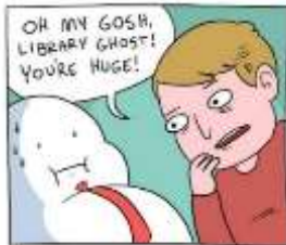
Figure 11. Episode 40

The second subsystem of judgment is normality, which deals with how unusual someone is. The example of normality.