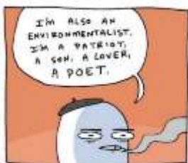
Figure 12. Episode 26

Based on the data above, "you're huge" shows that a negative judgment is categorized as (-) normality . From this data, It can express meaning, say how special he is with such a big body, or interpret it as a compliment to the library ghost.