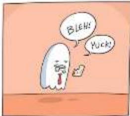
Figure 2. Episode 45

The context above shows how proud the library ghost is to be a ghost. "great" can also be interpreted as ability, quality, or excellence far above normal. It shows his feelings of (+) un/happiness .