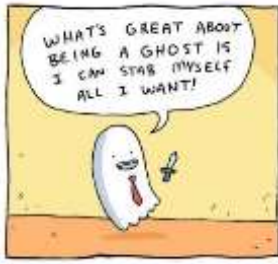
Figure 1. Episode 11

What's great 1 about being a ghost is that I can stab 2 myself all I want 3 !