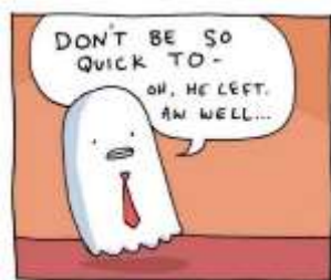
Figure 18. Episode 26

The last subsystem of appreciation is a composition that relates to quality. Martin White (2005) stated that composition is related to perception (our view of order). An example of composition can be seen on the webtoon below.