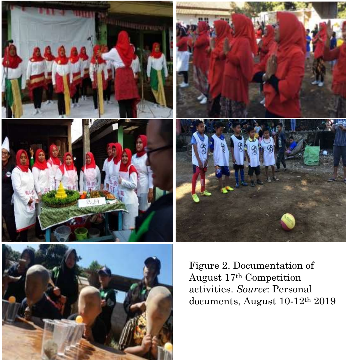
Figure 2. Documentation of August 17 th Competition activities.