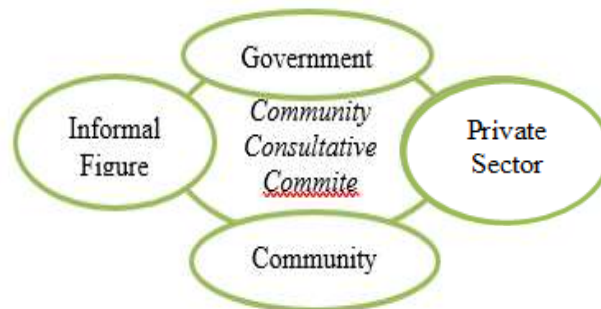
Figure 3. Relationship between core components of community development managers.

In this case, conceptually it is important to understand the characteristics of the community development management components so that they have a close cooperative relationship in providing complementary ideas, ideas, support, assistance. Illustration of the concept is shown in Figure 4.