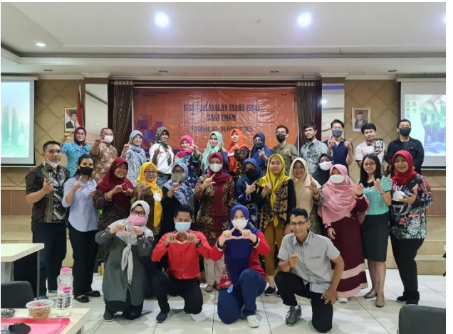
Figure 1 . Wiradesa Batik Village UMKM Training Participants and Service Team

On 23-24 July 2022, a workshop on calculating and preparing a capital budget and a business feasibility study was carried out by the community service team for the MSMEs of Wiradesa Batik Village.