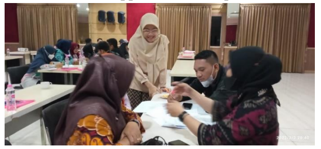
Figure 2. Practice Calculating and Preparing Capital Budgets accompanied by the Service