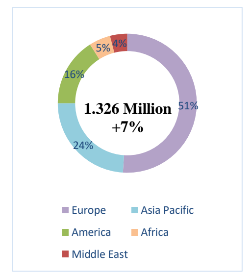
Figure 1. Foreign Tourist Arrivals by Region in Percent, 2017

The Asia Pacific occupies the position of the region with the second-highest number of tourists and revenue receipts from the tourism sector in the world after Europe in 2017. 24% of tourists come to the Asia Pacific region of the total world tourist arrivals. Asia Pacific tourism sector revenue is 29% of the total world tourism sector revenue.