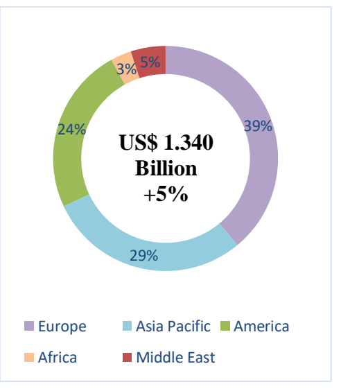
Figure 2. Tourism Sector Revenue Receipts by Region in Percent, 2017

sector by maximizing various factors that can support the increasing demand for international tourism in Indonesia.