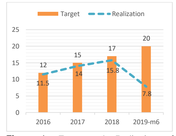
Figure 4. Target and Realization of International Tourism Demand in Indonesia, 2016 until 2019-m6

From this figure, it can be seen that the growth of foreign tourist arrivals continues to increase every year from these five countries from 4,912,162 in 2015 to reach 6,322,013 in 2018. This is because based on a survey conducted by the Visa-Pacific Asia Travel Association (PATA) in 2015, Indonesia is an attractive tourist place, many new tourist attractions, beautiful natural scenery, and affordable prices (Ministry of Tourism and Creative Economy of the Republic of Indonesia, 2016).