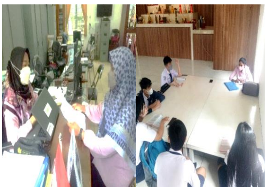
Figure 1. The interview process related to multicultural

This is also as stated by the Principal at YPSIM "Multicultural learning is also carried out with the content of student activities apart from the material that has been provided in learning, student activities involve interaction activities in every learning process in the classroom with the learning media that have been provided, students can participate and interact with peers as well as being part of the learning process. in existing multicultural learning activities"