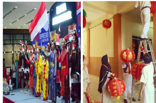
Figure 2. One form of multicultural activity

Day, Vesak Day, Chinese New Year, Hijri New Year, Dewapali.