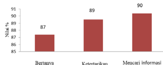
Figure 2. Percentage Value of Curiosity Aspects in Biotechnology Learning Using Modules.

Remarks: 1 = observing, 2 = grouping, 3 = interpreting, 4 = predicting, 5 = asking questions, 6 = hypothesizing, 7 = planning experiments, 8 = using tools / materials, 9 = applying concepts, 10 = communicating.