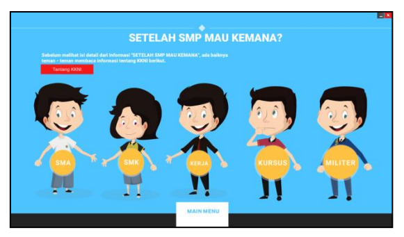
Figure 3 . After Junior High School Want Where?