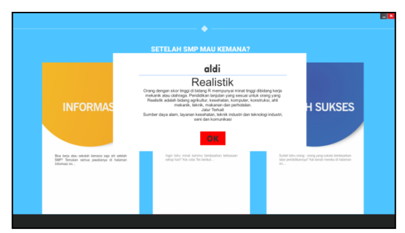
Figure 7 . Information on Career Interest Tests