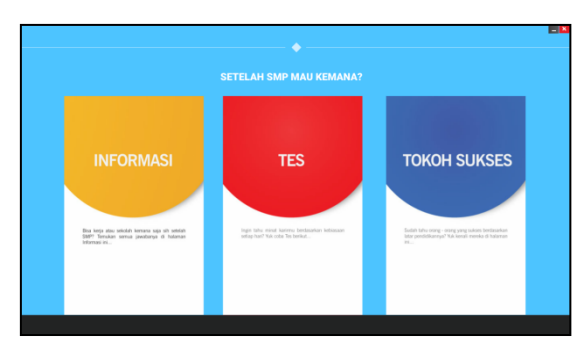
Figure 2. Main Menu