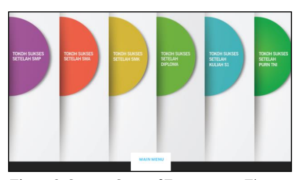
Figure 8 . Success Story of Entrepreneur Figures from Various Levels of Education