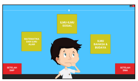
Figure 4 . Information on Study Programs and Career Prospects After Senior High School