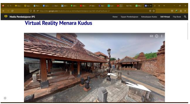
Figure 5. Virtual reality view in Google Site

The final stage of developing virtual reality -based learning media is by creating a container to embed virtual reality -based learning media . The platform chosen is Google Site, the selection of Google Site as a container for learning media is based on its ease of use. Participants under the guidance of the service team created a mini website using Google Site and added things needed in the learning process such as learning objectives, embedding teaching materials and embedding virtual reality .