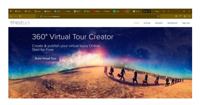
Figure 1. Theeasys website which is used as a platform for creating Virtual Reality - based learning media .

In addition to the introduction of the virtual reality creation website , the service team also introduced the application used to create 360 ° photos, namely by using the Google Street View application which can be downloaded via Playstore. The use of this application requires a Smartphone with an Android operating system.