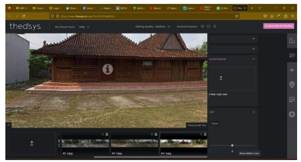
Figure 4. Display of 360 ° photo processing on the Theasys website

The results of the 360 ° photo taking practice were then entered into the Theasys website to be processed into virtual reality . Community service participants were given 360 ° photo materials that had been prepared by the community service team beforehand, namely photos of the Menara Kudus Mosque. The community service team accompanied participants in making virtual reality starting from uploading photos, combining photos, providing symbols in the photos, to embedding captions in the photos in the form of text, images or videos.