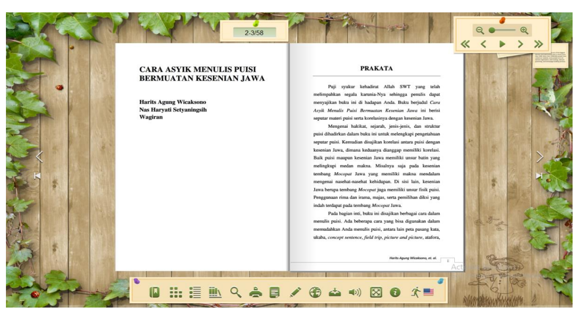
Figure 2 The beginning of the book

The beginning of the book contains the title page, foreword and table of contents.