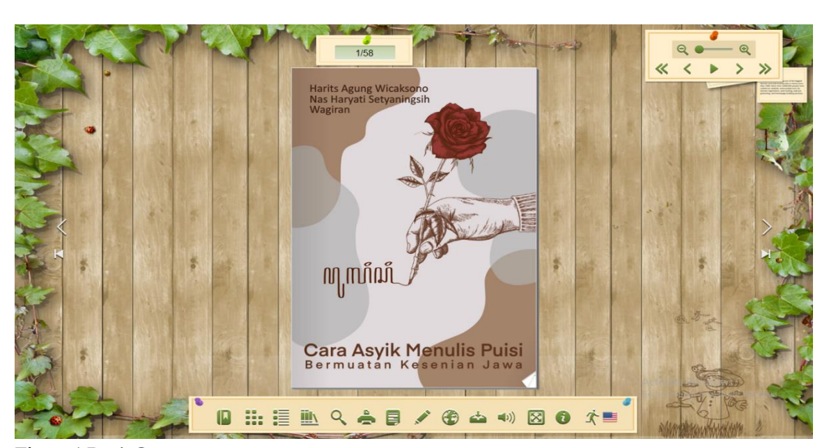
Figure 1 Book Cover

The development of a prototype for an enrichment book for writing poetry containing Javanese art using the Kvisoft Flipbook Maker application by researchers consists of several parts, namely the book cover, which consists of a front and back cover.