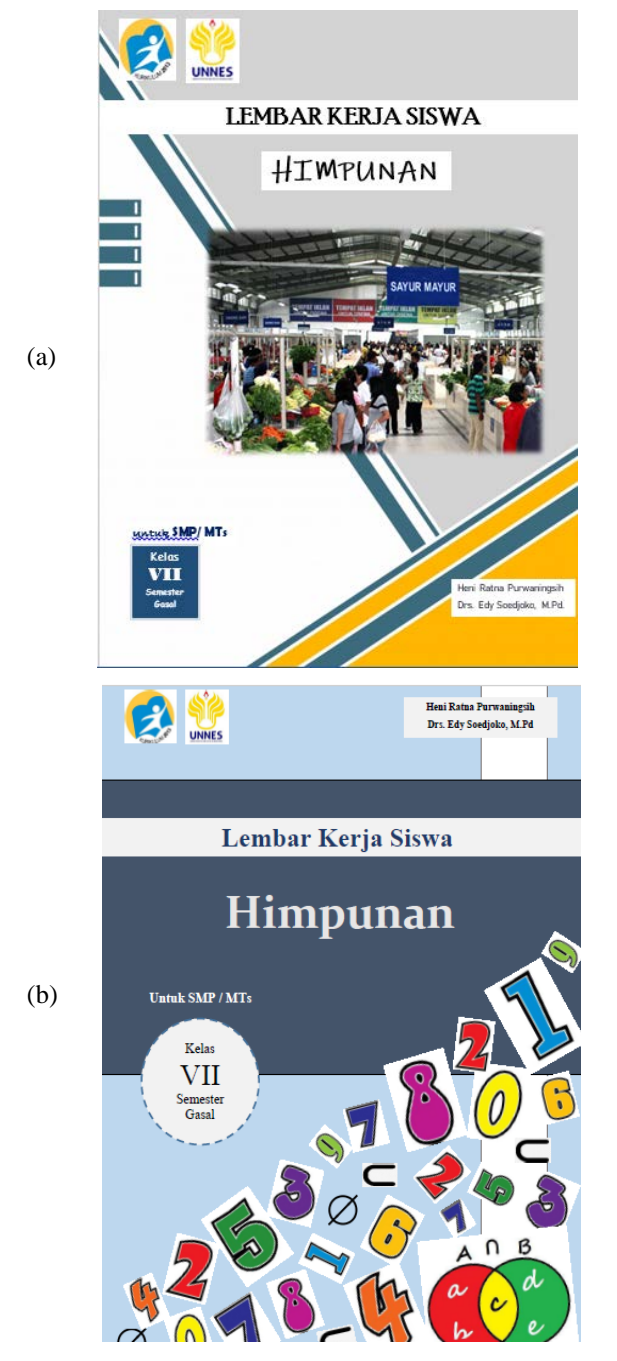
Figure 2. (a) Cover before revision; (b) cover after revision.

Figure 1. (a) Question before revision; (b) question after revision.