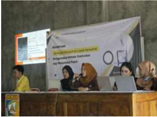
Figure 1. Welcome by the Head of Gemulak Village, Sayung, Demak