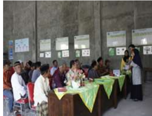
Figure 2. The resource person presents the making and working of the electrolysis device

collected. Electrolyzed water in the form of alkali is a type of water with alkaline properties or a pH value above 7 (Moentamaria et al., 2022). Alkaline water has many benefits, such as being suitable for consumption as a daily drink. Alkaline water helps maintain body hydration and compensates for excess acid. Water is acidic when it has a pH of less than 7 (Sa'idi, 2020). The acidic water has several potential uses, including as an external medicine, disinfectant, or germ-killing agent (Triyoso & Sari, 2022). Explaining the properties and benefits of the type of water gives people a better understanding of its potential use in daily life and its positive implications for health and body balance.