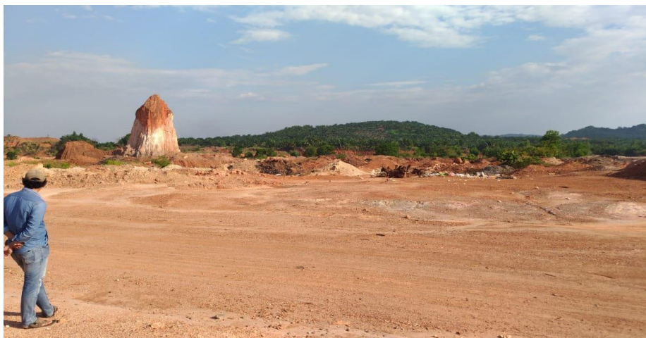
Crushed forest in West Kalimantan

https://www.mongabay.co.id/2021/10/31/two-decades-last-of-west-kalimantan-lost-125-million-hectares-of-forest