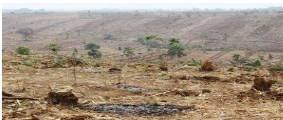
Forest destruction on the island of Java.

In addition , education and awareness public about importance guard environment is also necessary improved to create participation active in guard earth . With strong commitment from all parties , development economy and conservation environment No Again into two contradictory things . Both of them Can each other to complete , to create welfare term long for man without damage source Power nature that becomes support life people human . Here is damage environment consequence logging wild :