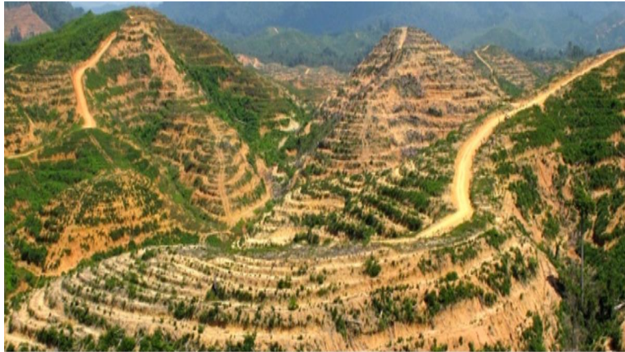
Damage forests in West Sumatra.

https://www.mongabay.co.id/wp-content/uploads/2016/06/orang-rimba3-DEforestation-one-of-the-causes-