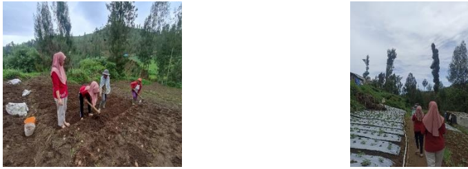
Gambar 1. Kondisi Ladang Kentang

KKNP Group 12 enthusiastically went directly to the field to see the conditions of potato farmers who are part of micro, small, and medium enterprises (MSMEs). They wanted to understand the challenges faced by farmers, starting from the planting process, maintenance, to marketing the harvest. After conducting observations, group 12 not only witnessed the struggles of the farmers, but also took the initiative to provide assistance by participating in the potato planting process.