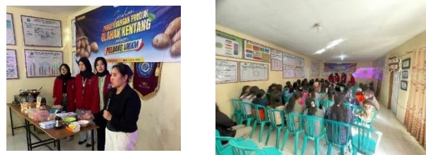
Gambar 4. Pelaksanaan Sosialisasi

The activity started at 15.00 WIB at the Ngadiwono Village Office together with the PKK (Family Welfare Empowerment) mothers and also together with the ranks of village officials such as the Village Head to conduct socialization from the KKN-P 12 Umsida Team regarding the Socialization Program for the Development of Processed Potato Products as an Opportunity for MSMEs. Guests are welcome to ask questions about the Development of Potato Processed Products as an Opportunity for MSMEs and processed potato products that have been made by the UMKM Division of KKN-P 12 Umsida. The activity ended at 17.00 WIB. The community gained new information and skills on how to make processed potato products that have high selling value, and are useful for developing and boosting MSMEs in Ngadiwono Village.