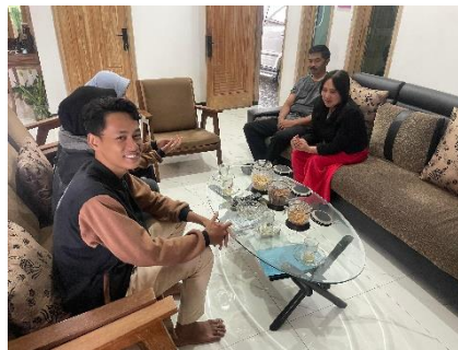
Gambar 2. Penyampaian Program Kerja

Representatives of the Umsida KKN students met with the Village Head to explain their work program, namely making potato products to increase the added value of agricultural products. They explained the types of products, the objectives of the program, and the benefits for the community. The KKN students met with the Village Head to ask for help in inviting residents to attend the socialization of their program. In the meeting, they explained the importance of community participation so that the program can run effectively and provide benefits to the community. The Village Head also agreed and was willing to help disseminate information and invite residents to attend the activity. The Village Head welcomed this plan and provided input so that its implementation would be more effective.