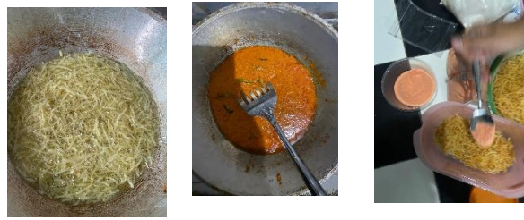
Gambar 3. Proses Pembuatan Ngaditatoes

Ngaditatoes is a crispy snack made from finely chopped potatoes and fried until dry. The manufacturing process begins by peeling the potatoes, then grating them into thin shavings. After that, the grated potatoes are washed clean to remove their natural flour so that the fried results are crispier. Next, the potatoes are fried in hot oil until golden brown, then drained so that excess oil is absorbed and the texture remains crispy. Meanwhile, the seasoning is made from a mixture of garlic, chili, sugar, and salt which is sauteed until cooked and gives off a fragrant aroma. Finally, the French fries are mixed with the finished seasoning, stirred until evenly distributed so that the seasoning is perfectly absorbed. Ngaditatoes is ready to be served as a snack or food complement.