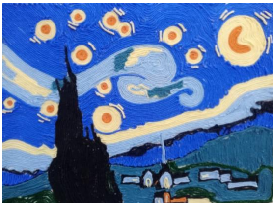
Figure 2. The Spinning Sky: Inspiration from Starry Night (2024) by Oky Susanti, wool yarn on canvas, 30 x 40 cm

work, which was directly inspired by the use of color in The Starry Night .