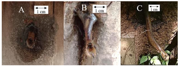
Figure 4. Nest entrance ornamentation of Heterotrigona itama : A. Funnel-shaped entrance with the spread of propolis, B. Droplet of propolis, and C. Cylindrical tube with Irregular ridges. Scale bar: 1 cm (private collection, 2023).

Nest entrance characteristic. Nest existence is indicated by a building that functions as the entrance to the nest. It not only serves as a pathway for entry and exit but also serves as a marker for the nest (Febrianti et al., 2020). The nest entrance is a specific characteristic (Sriwahyuni et al., 2023) and tingless bees construct a unique, funnel-shaped entrance that resolves an evolutionary conflict between foraging efficiency and defense (Shackleton et al., 2019). Figure 4 explains the nest entrance of H. ornamentation itama from three meliponiculture practices in Banjar Regency, Indonesia. Fig 4.A Funnel-shaped entrance with spreading of propolis. Fig. 4. B Funnel-shaped entrance with a droplet of propolis. Fig. 4. C Cylindrical tube-shaped entrance with irregular ridges.