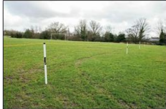
Figure 4 Green Barrier System

surrounding environment. Trees also play a role in reducing heat and noise so that the perpetrators of activities can walk smoothly without interruption.