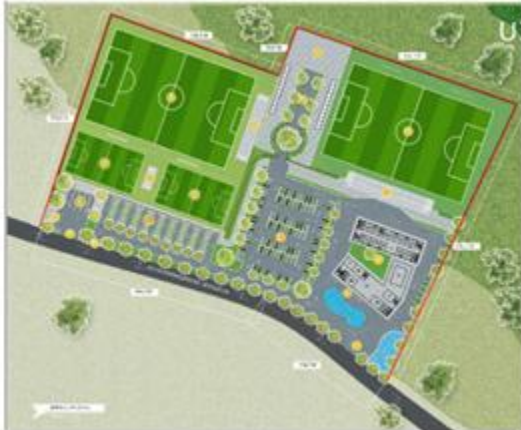
Figure 11 Siteplan Design

The site plan is the planning and arrangement of physical elements on the site. In the design of the Football Training Center with a Sustainable Architecture approach, visitor vehicle circulation paths, placement of green open spaces, utilities, and other supporting elements that function to support activities in this building.