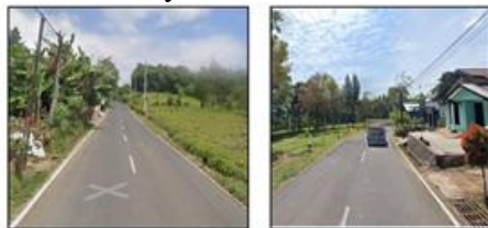
Figure 10 Tread Accessibility

Based on accessibility, the site is located in a settlement that is still not densely populated. The site can