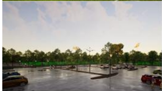
Figure 17 Exterior Perspective