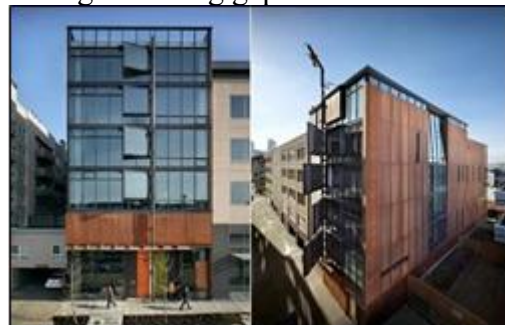
Figure 1 Building Ventilation

Building ventilation is intended to provide natural airing, because the site is located on a plateau that still has fresh air, so it can be utilized as natural airing through building gaps.