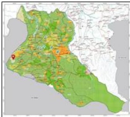
Figure 6 Map of Bumijawa District

Based on the existing land needs and consideration of the current land conditions of Tegal Regency, the potential land is located in Bumijawa and Slawi Districts.