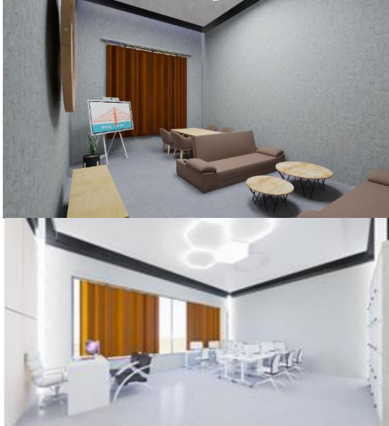
Figure 18 Interior Perspective 2