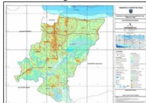
Figure 5 Map of Tegal Regency Spatial Structure Plan

In addition to the suitability of the land use function, the availability of adequate infrastructure and a strategic location close to accommodation facilities is one of the main aspects in determining the location of the Football Training Center. This is determined to facilitate the fulfillment of the needs of the perpetrators of activities at the Football Training Center.