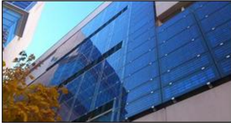
Figure 2 Solar Panels on the Building

a source of electrical energy. The number of panels affects the amount of heat that can be converted into electrical energy. These solar panels can be installed on the roof of a building or on the outer wall of the building itself. The benefit of this solar panel is as a producer of electrical energy other than PLN, so that the use of PLN electricity can be minimized for electricity needs in this Football Training Center building.