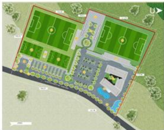
Figure 12 Situation

The situation in the design site area has many elements that are interconnected according to their respective functions.