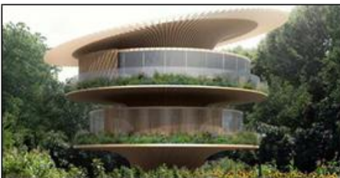
Figure 3 Protection Membrane on the Building

Protection membrane from outside means that the natural atmosphere that enters the building brings comfort, without fear of the health effects of environmental pollution, especially air pollution outside the building. Utilize existing vegetation on site to protect activities in the building and maintain comfort.