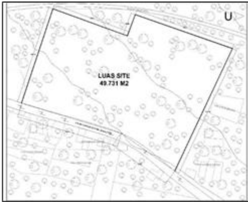
Figure 9 Tread

The site is located on Jl. Karanganyar, Bumijawa Village, Bumijawa Kec. Bumijawa, Tegal Regency, Central Java, with an assessment score of 350. The site is considered to have very easy accessibility, clear visibility, adequate infrastructure and utilities, contoured topography, and a fairly low noise level.