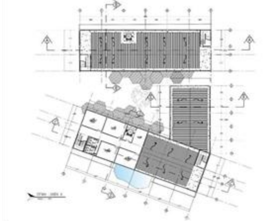
Figure 16 4 th Floorplan

On the 4th floor there is only in Building A, functioning as a management building. There are R. Operational staff, R. administrative and financial staff, R. coaching & Education staff, R. Marketing staff & Musholla.