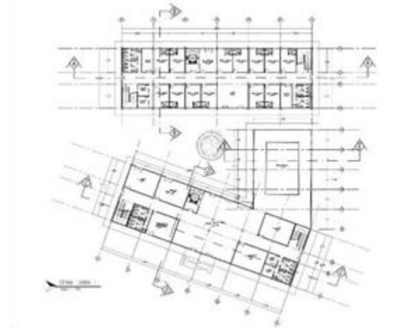
Figure 13 1 st Floorplan

pantry, janitor and KM / WC. Building B is used as a dormitory building for the academy participants, there is also a warehouse, pantry, and KM/WC.