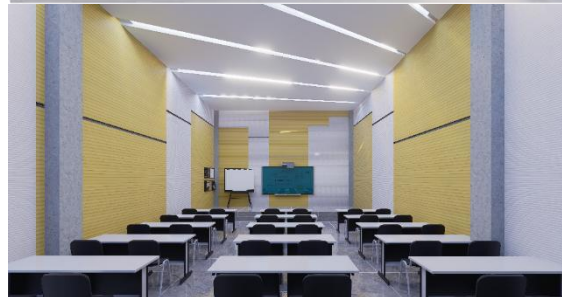
Figure 18 Interior Perspective 1