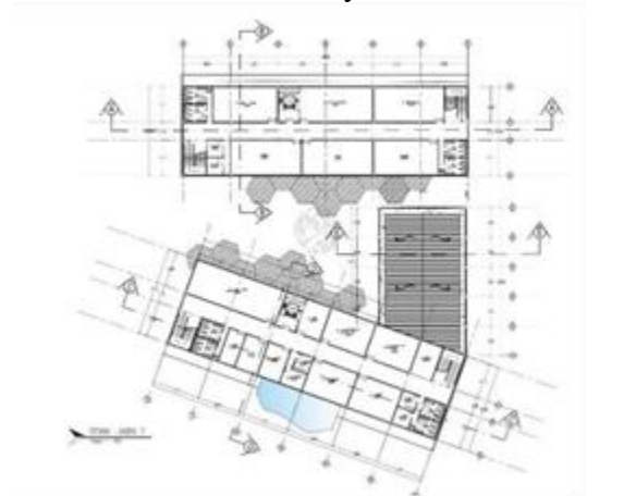
Figure 14 2 nd Floorplan

On the 2nd floor, Building A functions as the office building for the management staff, there is a press conference room, guest room, food staff and nutritionist, physical testing laboratory, prayer room, archive room, director's room, secretary's room, manager's room, physiotherapist's room, doctor's room, pantry, janitor & KM/WC. Then for building B functioned as a building for visitors and academy participants, there is a Football Store, R. Gym & Fitness, R. Audiovisual, Canteen, Hall, & Gallery.