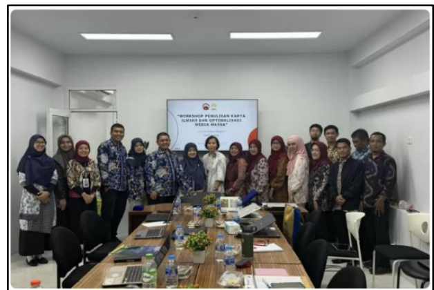
Figure 2. Implementation of activities

From the evaluation results, participants provided many inputs for improving similar activities in the future. One of the most frequently mentioned inputs was the need for more intensive assistance in the process of submitting articles to reputable journals, such as accredited national journals, and reputable international journals such as Scopus. In addition, participants also suggested that this activity be supplemented with training on access to more diverse scientific reference sources to support the quality of their writing.