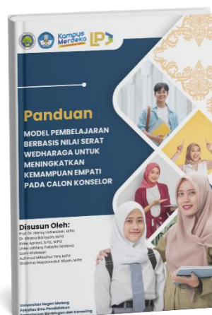
Picture 3. Learning Guide to Strengthening Empathy Based on Serat Wedharaga Values

The second stage is design, which involves designing a case method learning model based on serat wedharaga values to increase the empathy of prospective counselors. The designed learning model consists of sixteen meetings, with a lecture design consisting of (1) a lecture contract; (2) twelve times of providing empathy strengthening material based on the values of serat wedharaga ; (3) UTS; and (4) UAS. The material provided contains aspects of strengthening empathy, including aspects of social interaction, aspects of cognitive behavior, and aspects of emotional identification that are integrated with the values of serat wedharaga , including humility, honesty, enthusiasm for learning, responsibility, language manners, and manners. This learning model is outlined in the guide as follows.