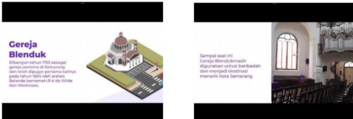
Figure 3. Content Payload Example

The workings of the "Digital History" application are designed to be very simple both in terms of operation and content, so it is easy to apply during the learning process. The "Digital History" application can be installed on smartphones through the Google Play Store. The learning content in the application carries the mission of promoting public history in Semarang City, for example, historical building materials such as Blenduk, Marba, and Spiegel Churches, which are carefully arranged to look more attractive.