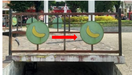
Figure 3. Translation of additional elements around the southwest fountain