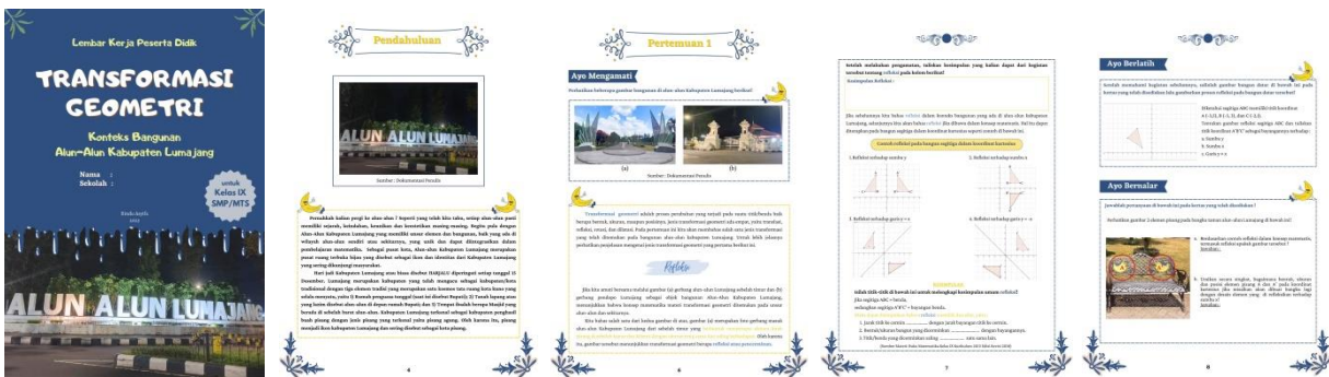
Figure 4. Students' Worksheet component design

The Students' Worksheet design was made as attractive as possible in the context of the Lumajang Regency Central Park Building as an object for introducing geometric transformation material. The geometric transformation Students' Worksheet design with the context of the Lumajang Regency square building that has been created includes (1) Front cover; (2) Table of contents; (3) Exposure to KI, KD, learning objectives and work steps; (4) Concept map; (5) Introduction (contains a description of the Lumajang Regency square); (6) Meeting 1 (contains reflection material as well as practice questions); (7) Meeting 2 (contains translation material as well as practice questions); (8) Meeting 3 (contains rotation material as well as practice questions). The material and questions in each meeting are presented in contextual and mathematical form. Figure 5 below shows several Students' Worksheet design components ready to be validated.