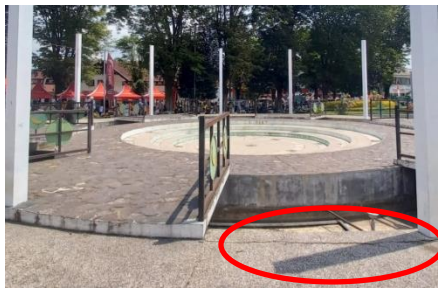
Figure 4. Rotation of the shadows of the buildings surrounding the southwest fountain

Figures 2-4 above are concept images of the geometric transformation of the Lumajang Regency square building object. Through the results of observations made by researchers on the Lumajang Regency square object, several buildings and supporting elements can be used as mathematics learning objects, especially material for introducing geometric transformations. Integrating the context of the Lumajang Regency Central Park in mathematics learning can be used as material for creating media or teaching materials for mathematics learning based on a contextual approach. Several geometric transformation concepts found in Lumajang Regency square building objects are reflection, translation (shift), and rotation.