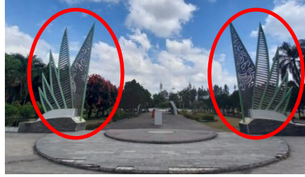
Figure 2. Reflection at the entrance gate to the Eastern Central Park