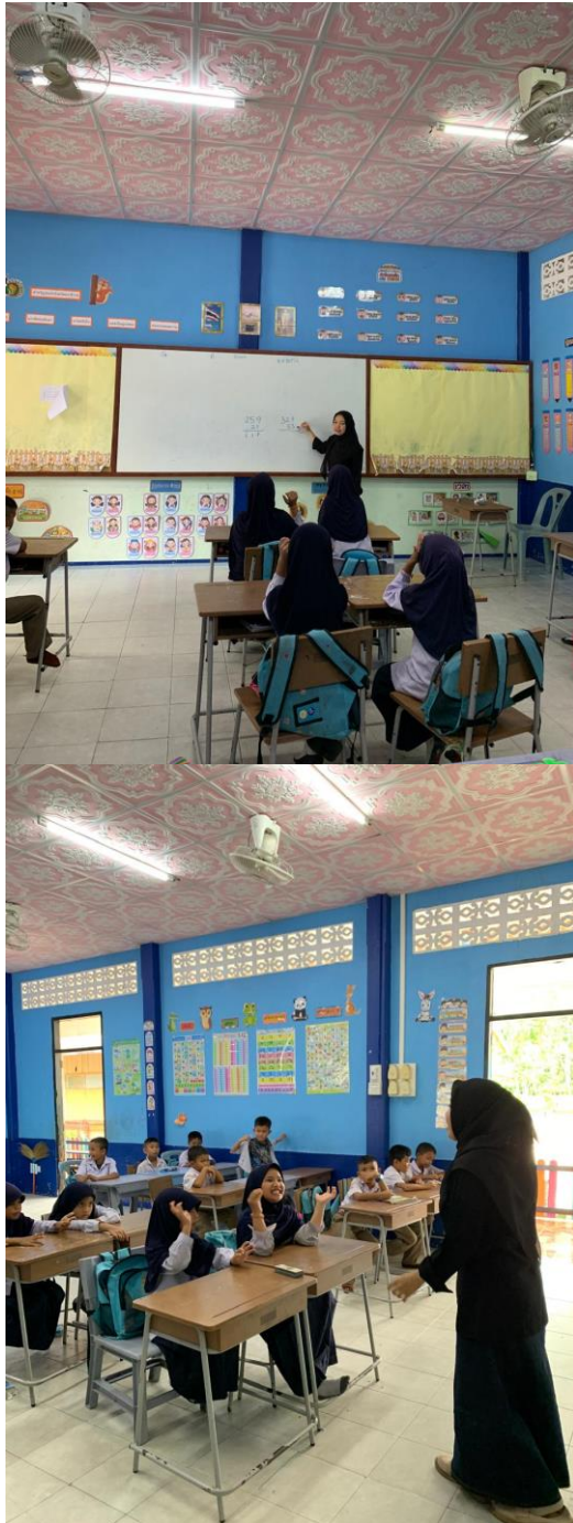
Figure 2. learning situation at the research subject

After learning, students' concept understanding was measured. The following table presents data from the results of research on students with exposure to data analysis as shown in Tabel 1.