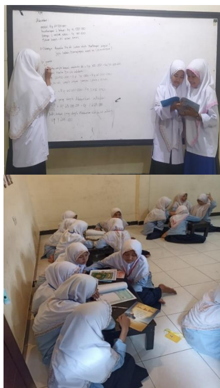
Figure 4. Learning process

Based on observation data, this success is supported by teachers who intensively read user manuals that guide teachers' learning processes according to teaching modules using the PBL model. This data was obtained based on the results of interviews conducted with model teachers after the learning was completed. It is in line with Arifin 2020, Tesfaw et al., 2024, that the instruction book is not only a direction but also a teacher's guide in making it easier to explain the material through the achievement of learning objectives.