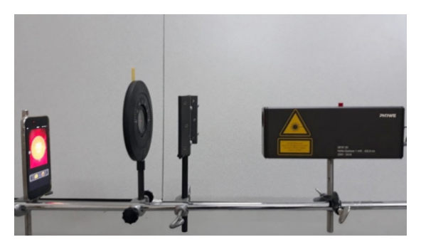
Figure 1. The photography of the apparatus.

loyed, emits red light with a power of 1mW and a wave length of 632.8nm. The photography of the apparatus is shown in the Figure 1.