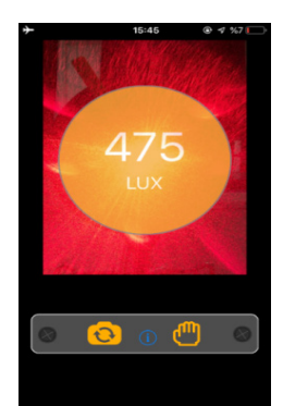
Figure 2. The photography of light meter application employed in the study

The energy flow rate of an electromagnetic wave is basically expressed by the Poynting vector, \vec{s} . For the electromagnetic waves, the electric and magnetic field vectors are always perpendicular to each other and sinusoidal at any point, therefore the Poynting vector continuously changes over time. Since the frequencies of typical electromagnetic waves are very high, the Poynting vector changes over time very rapidly, therefore one needs to deal with the averages instead of instantaneous values. The average value of \vec{s} , at any point, is called the Intensity; I, which expresses the energy flow per unit time and per unit cross sectional area. The energy flow rate of an electromagnetic wave, Poynting vector, 3, can be formulated as,