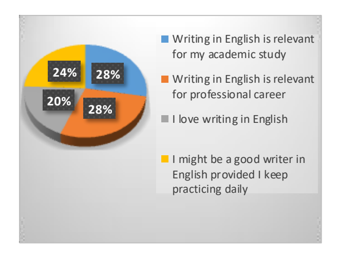
Figure 1. Students' view on their English writing skill.

choose writing in English to support their career is also 19. Then, it is followed by 18 students who have positive perception on writing in English if they keep practicing while 16 of them stand to love writing in English.