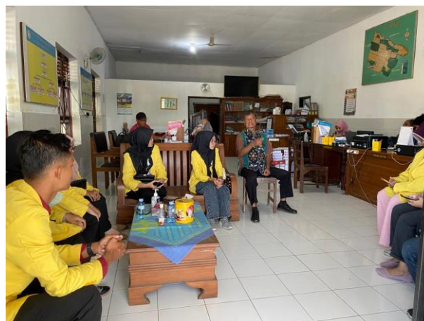
Figure 2. Forum Group Discussion

Engagement and awareness public For guard sustainability environment is very important in management rubbish plastic. Need exists increase awareness the people of Brangkal Village about importance manage rubbish plastic. One of method best For manage rubbish for public is with reduce rubbish with effective way . This is a must too increase awareness public about method manage waste plastic and how matter That impact on the environment.