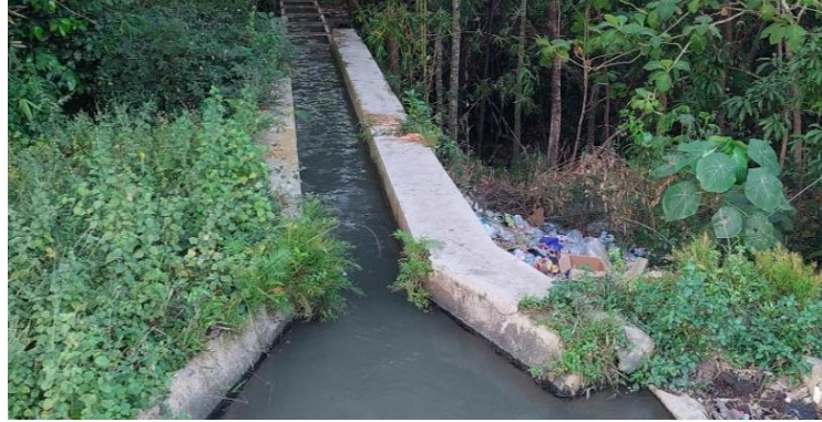
Figure 3. Stack trash on the edge river

barracks related management rubbish. After coordinate with device village, KKN implementers review direct related condition environment in Brangkal Village. From stage This team executor find various problem related heap thrown away rubbish carelessly by people on the banks of the river ( see Figure 3). As for the problem other that is park village As it should be become village icon However moment This the condition abandoned ( see Figure 4).