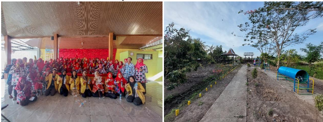
Figure 7. Results of activities training management rubbish plastic