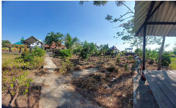
Figure 4. Abandoned Brangkal Village Park

Furthermore team do initiative For carry out socialization and training related with the impact caused from waste rubbish plastic to environment and do cooperation with Ms PKK for turn on back to Village Park at once utilise results craft hand through management trash that will made. Purpose accomplished socialization and training This is For build awareness the people of Brangkal Village about importance manage rubbish plastic. Socialization and training process walk with fluent attended by members of the Brangkal Village PKK Mother. The Village Park design ( see Figure 5) with draft utilization rubbish bottle plastic become ecobricks as fence barrier ditches and flower pots for planting media as well as decorate park .