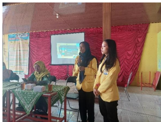
Figure 6. Activity socialization management rubbish