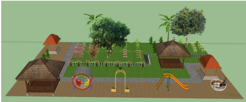
Figure 5. Brangkal Village Park Plan