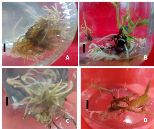
Figure 2. Roots of B. balcooa developed on MS medium containing 10 mg/l IBA + 5mg/l NAA. (A) smaller diameter and browning roots, (B) blackening base shoot produced brown roots, (C) larger diameter and white roots, (D) browning shoots produced white roots. Black line: 2mm.

This study also showed that the roots grown on the same medium showed different diameter and length. Some plantlet produced a longer root with smaller diameter (Figure 2A-B). Eventhough, most of the plantlet produced roots with bigger diameter (Figure 2C-D).