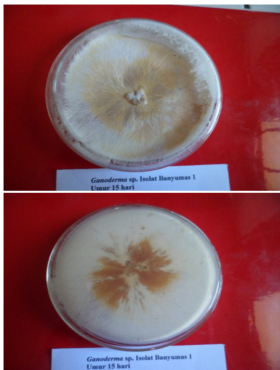
Figure 1. Colony of Ganoderma sp. Banyumas 1 isolate on Potato Dextrose Agar, 15 days at room temperature (27-29°C), reverse white to brownish.