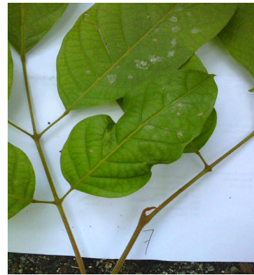
Figure 8. Aglaia argentea