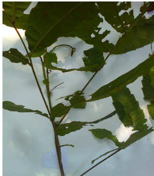
Figure 1. Pometia acuminata

Table 3 shows that there are two species of tree widely know as commercial trees. They are Pometia pinnata (Figure 4) and Octomeles sumatrana . Meanwhile, there are 8 non-commercial species of tree, including Gironniera nervosa Teijsmanniodendron Bogoriense (Figure 2), Litsea timorina , Pimelodendron amboinicum , Chisocheton ceramicus , Gymnacantha farquaria , Pometia acuminata (Figure 1), and Horsfieldia irya (Figure 3). The Gironniera nervosa has the highest IVI among other species. According to Kuswandi et al. (2015) the species with the highest IVI in a habitat may be the indicator of the habitat. The decrease in the commercial species resulting from logging will have significant impact on the change in structure. The change in floristic composition will have significant impact on the structure and vegetation growth in a logging area (Sandor & Chazdon, 2014).