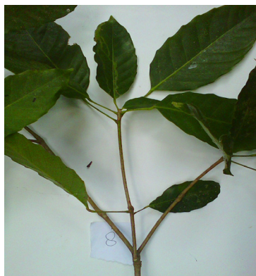
Figure 9. Pimelodendron amboinicum