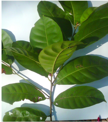
Figure 5. Palaquium lobbianum