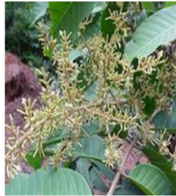
Figure 7. Chisocheton ceramicus

nues for long time, it will have serious impact on the dynamic equilibrium of the forest. The condition is at the forest dynamic equilibrium level (Lima et al. , 2016; Ma et al. , 2016).