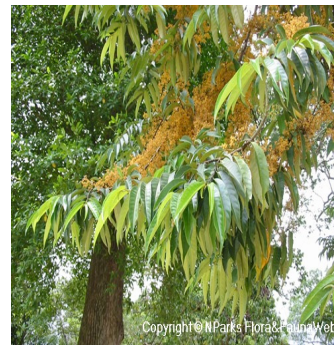
Figure 3. Horsfieldia irya