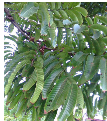
Figure 4. Pometia pinnata