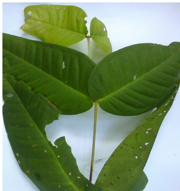
Figure 6. Syzygium sp.