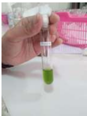
Figure 6. Positive quinone test using sodium hydroxide reagent on S. platensis

The triterpenoids and steroids identification test, the color was initially brown, which at the end of the observation period turned into yellowish-green color. This result showed that our sample of S. platensis does not contain triterpenoids and steroids.