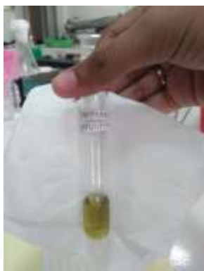
Figure 7. Negative triterpenoid and steroid identification test using chloroform, anhydrous acetate and H_2SO_4 reagent on S. platensis sample from Karimun Jawa Sea, Indonesia.

The triterpenoids and steroids identification test, the color was initially brown, which at the end of the observation period turned into yellowish-green color. This result showed that our sample of S. platensis does not contain triterpenoids and steroids.