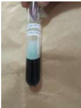
Figure 3. Positive saponin test using foam test on S. platensis

After agitation of the mixture, a layer of foam was present on the top part of the mixture, which was present until 10 minutes were elapsed. The foam did not subside upon the addition of one drop of hydrochloric acid. Therefore, this result indicated that S. platensis extract contains saponin. This result were in line with previous researches (Fithriani et al., 2015; Mane & Chakraborty, 2018; Saputra, 2018; Suratno, 2010) which found that Spirulina sp. contains saponin.