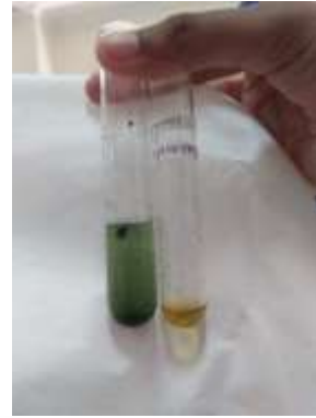
Figure 4. Negative phenolic identification test using \text{FeCl}_3 reagent on S. platensis

Phenolic substance identification test results in color change from green to yellow after the addition of \text{FeCl}_3 was observed. Therefore, this result showed that the sample of S. platensis does not contain phenolic substances.