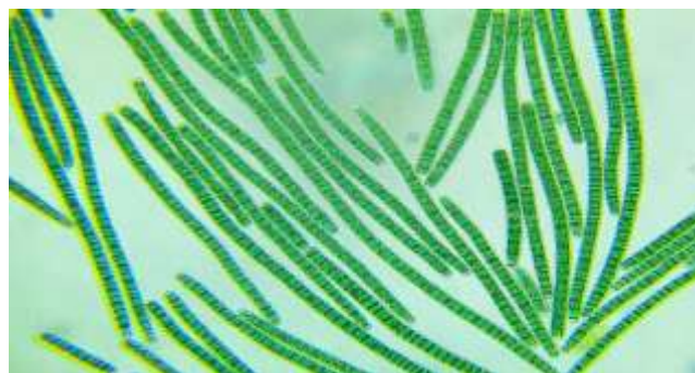
Figure 1. Microscopic image of Spirulina platensis (Whitton, 2012)

This experiment began with the maceration of S. platensis sample. The maceration process was done to extract the active ingredients contained within the Spirulina cells, so that they can be analyzed once they are no longer trapped inside the cells. The liquid then was filtered using Whatman filter paper to separate the solute from the solids, before further evaporation to obtain a thick extract of S. platensis .