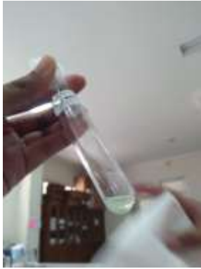
Figure 2. Positive alkaloid test using Mayer's reagent on S. platensis

After agitation of the mixture, a layer of foam was present on the top part of the mixture, which was present until 10 minutes were elapsed. The foam did not subside upon the addition of one drop of hydrochloric acid. Therefore, this result indicated that S. platensis extract contains saponin. This result were in line with previous researches (Fithriani et al., 2015; Mane & Chakraborty, 2018; Saputra, 2018; Suratno, 2010) which found that Spirulina sp. contains saponin.