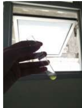
Figure 5. Positive flavonoid test result using magnesium and hydrochloric acid-alcohol reagent on S. platensis

We noticed a color change from dark green to yellow was observed in our flavonoid test. This result showed that the S. platensis sample positively contains chalcone, aurone, and flavone content. Several previous researches also found similar results regarding the identification of S. platensis extract from another region, including in India (Fithriani et al., 2015; Mane & Chakraborty, 2018).