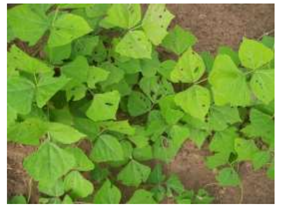
Figure 3. Damage of Ootheca mutabilis and Medy thia quaterna on P. erosus at growing stage

The percentage of the perforated green pods (Figure 4) was significantly low in P. erosus plots comparatively to cowpea plots where it was very high (P <0.0001) (Table 4). From the green pods of cowpea and P. erosus , Piezotrachelus varium was record-