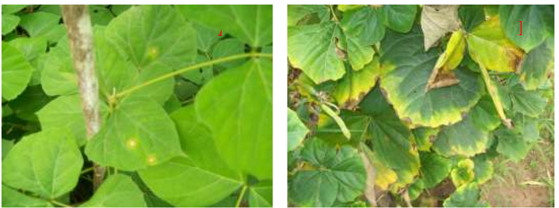
Figure 5. Symptoms of Cercospora spots (A) and blight (B) on leaves of P. erosus

According to the leaf blight, symptoms are characterized at early stage by a large yellowing of the leaf margin followed by a wide lesion of varying sizes moving from leaf tip inwardly. When the attack is severe, the margins of the whole leaf blighted. The inside of the lesions are small and very hard black balls more or less round. These bodies look like sclerotia and come from the arrangements of the mycelium. The colony of the fungus causing the disease showed a black mycelium. When each of the two fungi were separately re-inoculated to healthy plants of P. erosus, they developed 7 days after inoculation, similar symptoms as those observed in the field, while plants inoculated with only agar as control showed no symptoms. For the both fungi, Koch's postulates were confirmed by their re-isolation from artificially inoculated plants. Apart from these two fungi reported on P. erosus in this study, Alternaria dauci, Chaetoseptoria wellmanii, Erysiphe communis, Erysiphe polygon, Leveillula taurica, Phaeoisariopsis griseola were also reported as pathogens of P. erosus (Kahn & Lima, 2001).