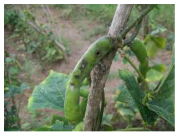
Figure 4. P. erosus paods attacked by Piezotrachelus varium

<sup>1</sup>Mean of 40 repetitions. Means followed by the same letters in the same column are not significantly different according to Student-Newmann-Keuls test with P = 0.05