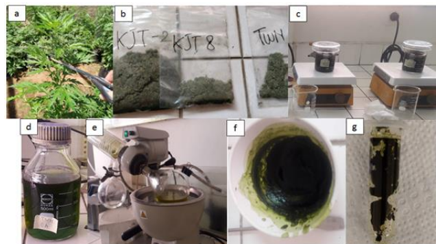
Figure 1. (a) A. cina plants, (b) dry powdered samples, (c) maceration process, (d) filtrate, (e) filtrate condensation using a rotary evaporator, (f) dried extract, and (g) collected extract for antibacterial analysis.

vacuum (Eyela A-1000S) at 40°C. The extracts were dried at room temperature and were stored in the refrigerator until further analysis. The dried and powdered leaves (shoots) of A. cina were extracted by the maceration method using ethyl acetate as shown in Figure 1.