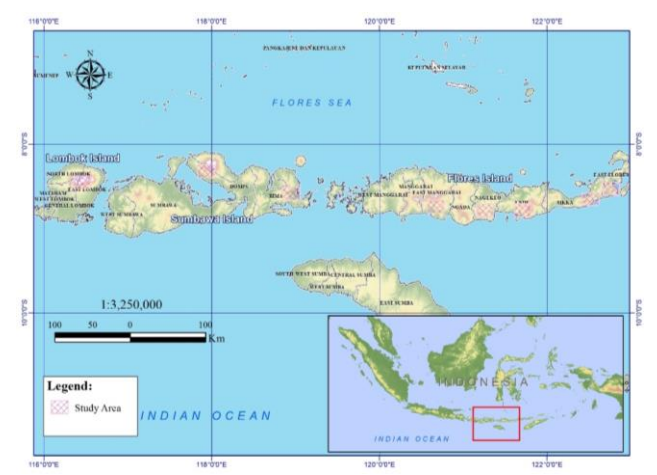
Figure 1. Field study locations to record Gyrinops versteegii data.

Field exploration was conducted on 2018 and 2019 in NTB and NTT (Figure 1) to find out the latest distribution of both cultivated and natural G. versteegii . Handheld Garmin GPS was used to record the geographic coordinates of G. versteegii . Specimens (evidence of exploration) were stored in the Herbarium Hortus Botanicus Baliensis , "Eka Karya" Bali Botanical Garden in Bedugul. An ethnobotanical note of G. versteegii from the field was obtained by conducting open interview to key informant.