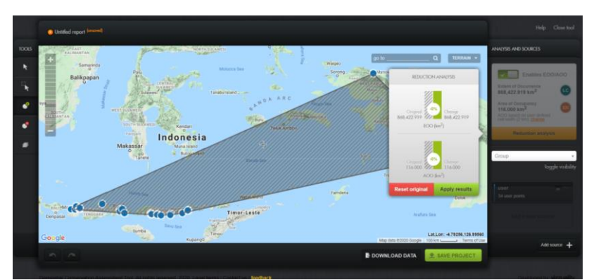
Figure 6. Results of data analysis using the Geospatial Conservation Assessment Tool / GeoCAT http://geocat.kew.org/