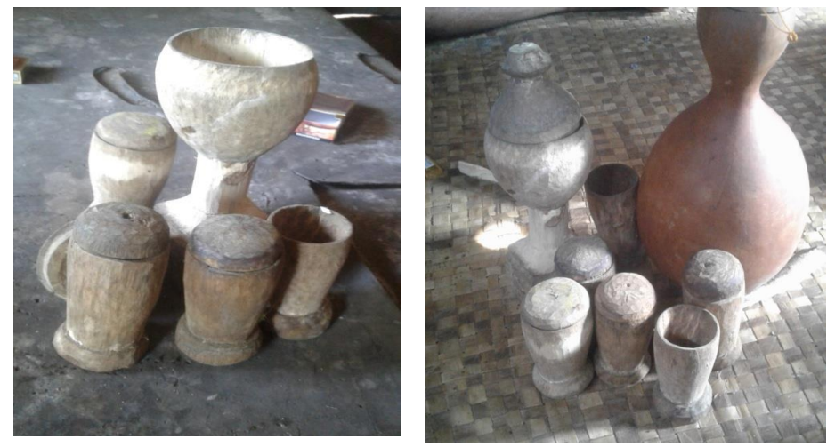
Figure 4. Handicrafts in the form of drinking sopi/moke tools made of Gyrinops versteegii wood on the island of Flores

of agarwood plant plus a mixture of other spices (19 types of spices). The agarwood farmer has also attended training from the Indonesian Food and Drug Research Institute (BPOM), and now his traditional medicine is in the process of making a permit. One pack of liniment is sold for around 30 to 50 thousand rupiah. In addition to liniment, the farmer also makes handicrafts from G. versteegii wood in the form of a set of glasses and others (Figure 4) which are used to serve guests typical Flores drinks (moke/ sopi). From this explanation, it can be concluded that agarwood plays an important role in the source of livelihood for some residents of the Flores community. The utilization of Gyrinops versteegii in Sumbawa tends to have fewer uses apart from its wood for sale. In Sumbawa, it is known to be used as traditional medicine however this information is lacking in the literature (Sukenti & Mulyaningsih, 2019).