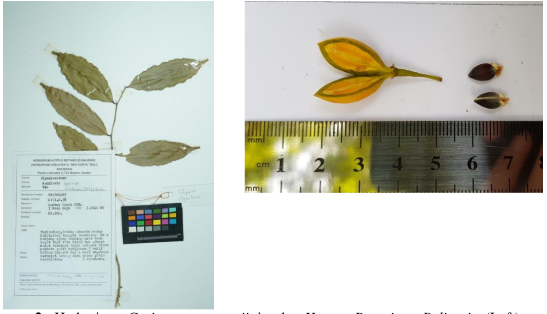
Figure 2. Herbarium Gyrinops versteegii in the Hortus Botanicus Baliensis (Left); Gyrinops versteegii fruit and seeds from exploration on Lombok Island, NTB 2018 (right)

The descriptions of the living and herbarium collections (Figure 2) from Gyrinops versteegii at the Bali Botanic Garden show the following descriptions: The stems are brown, sometimes some are white; tree height can reach 12 m; the leaf size is about 4 cm wide by about 13 cm long; single leaf; incomplete leaves; alternate leaves; the edges of the leaves are flat; elongated leaf shape; the tip of the leaf is tapered; dark green leaf color; glossy smooth leaf surface; flowers in tubular or funnel-shaped with 5-6 crowns; axillary flower; panicles; androgynous flower. The fruit is oval and fleshy (Figure 2). The color of the young fruit is green, after being old it becomes reddish yellow, and will break off by itself.