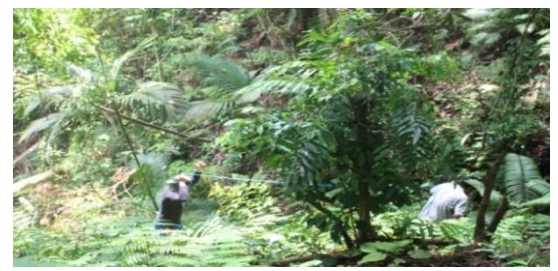
Figure 3 . Field exploration activities to determine the distribution and population of Gyrinops versteegii in NTB and NTT. Making a plot at the location in which G. versteegii was found.

moisture, sunlight intensity, and air temperature (Roemantyo & Partomihardjo, 2010; Sitepu et al., 2011; Sutomo & Oktavia, 2019). Refer to Yulistyarini et al. (2020), the distribution of G. versteegii has a strong correlation between the content of C organic and Soil Organic Matter (SOM) in Manggarai - Flores. This condition makes an indication that the preference location of G. versteegii is the fertile soil naturally.