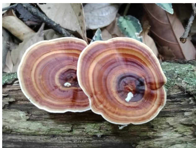
Figure 1. Coltricia cinnamomea

PDB (Potato Dextrose Broth) was considered the most suitable for the production of Laccase and Manganese peroxidase enzymes because both enzymes showed the highest activity compared to the