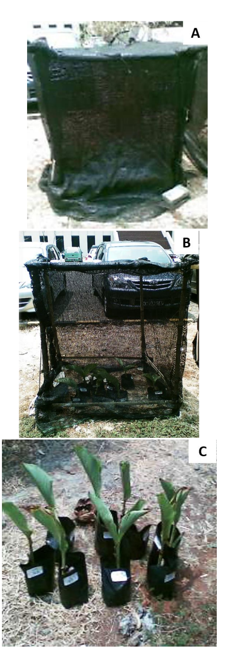
Figure 1 . Canna indica grown under three light environments: A. Deep Shade (25% of natural light); B. Moderate Shade (50% of natural light); and C. Full sun (100% of natural light).

Before measuring, plants from each treatment were taken out from the polybags and carefully cleaned to remove the soil from the rhizomes. The plants were then separated into leaves, stems, and rhizomes, and dried to a constant weight at 80°C to obtain the dry weights. The leaf area was measured using millimeter block paper as described by Pandey & Singh (2011). The SLA (Specific Leaf Area, the ratio of leaf area to leaf dry mass expressed in cm<sup>2</sup> g<sup>-1</sup>), LWR (Leaf Weight Ratio, the ratio of leaf weight to plant weight expressed in g leaf g plant<sup>-1</sup>), LAR (