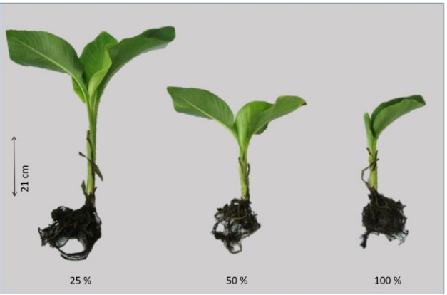
Figure 2 . Four months old Canna indica grown under three light environments: A. Deep Shade (25% of natural light); B. Moderate Shade (50% of natural

(F=9.20; p<0.015), LAR (F=39.12; p<0.001), and LWR (F=5.81; p<0.039) in C. indica grown in low light (deep shade treatment) compared to those grown in full sun treatment (Figure 3). The highest values of LAR, SLA, and LWR were observed in low light (deep shade) grown C. indica , and the lowest was in full sun-grown plants (Figure 3).