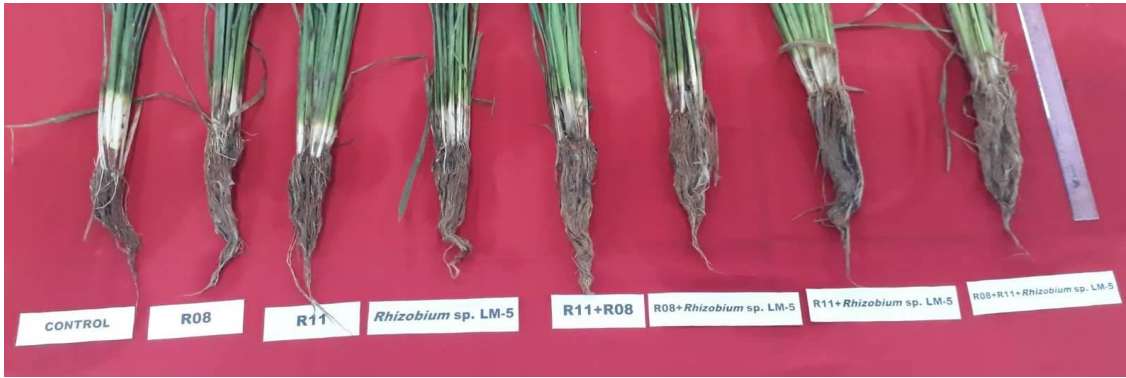
Figure 1. Roots of rice plant in different PGPR treatment.