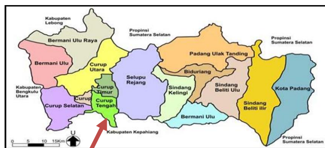
Figure 1. The study area map

The data were obtained by direct interaction with the diabetic patients who used these medicines and the traditional healers. The inclusion criteria for selecting the population were guided by Cohen et al. (2000). Based on Cohen et al (2000), the minimum sample size is 30 respondents. The data collection used a semi-structured questionnaire and a guided field walk with traditional healers.