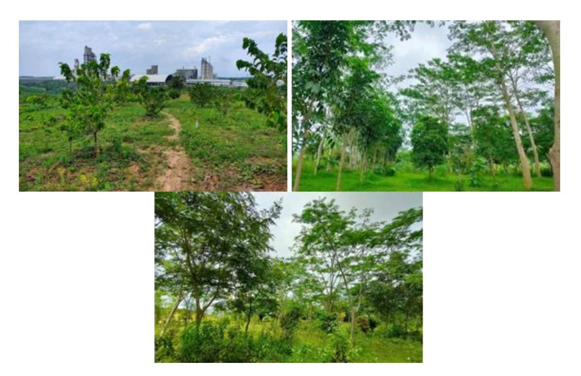
Figure 2. Typical vegetation characteristics in each observation sites: EduPark (EDP, upper left), green barrier for clay mining area (GBC, upper right) and green barrier for limestone mining area (GBL, bottom).