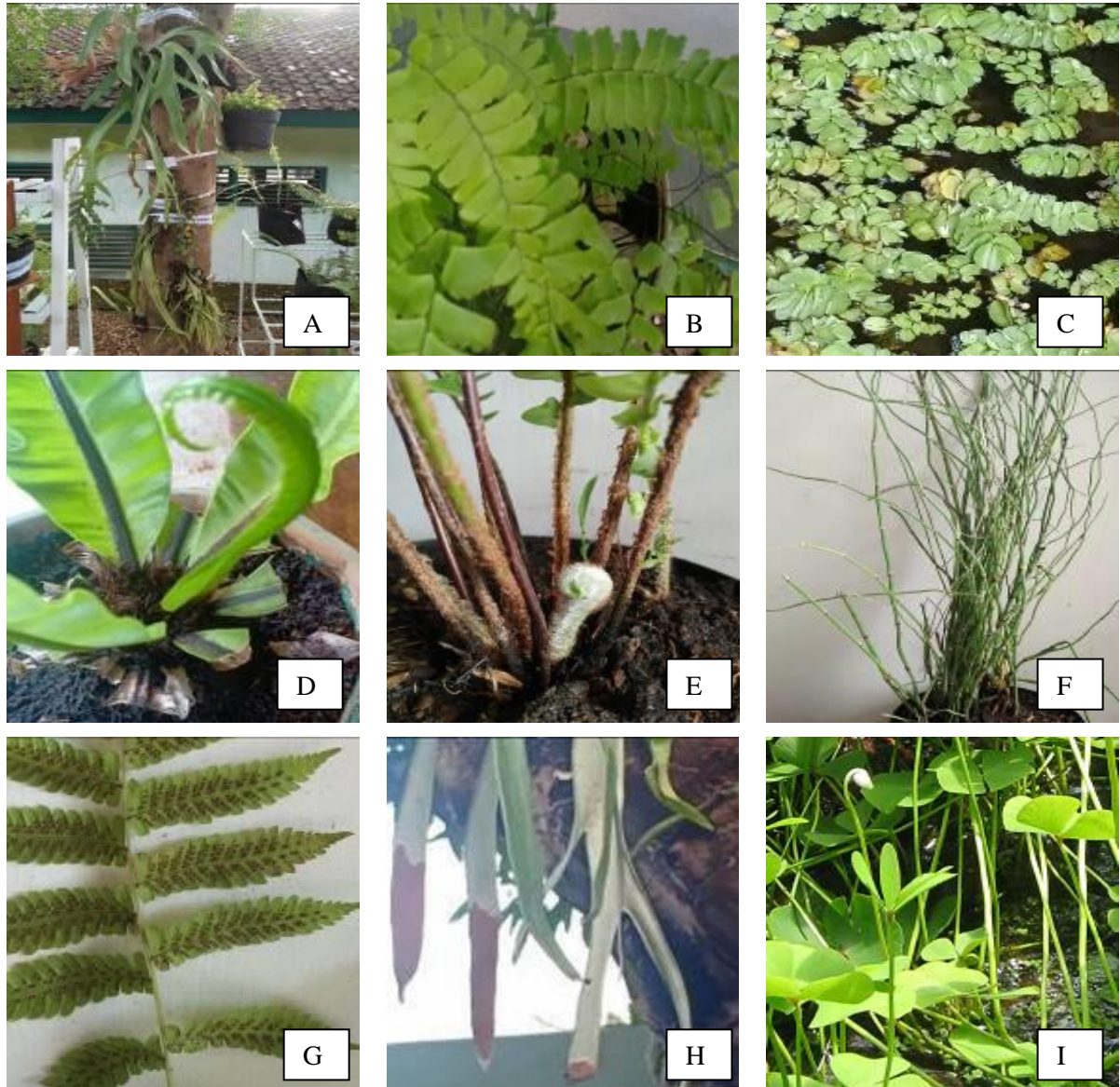
Figure 4. Some of the ferns planted on PTLR. A. Platycerium , an example of epiphytic fern. B. Adiantum , an example of terrestrial fern. C. Salvinia , an example of aquatic fern. D. Asplenium , with curled young leaves. E. Pteris , with curled young leaves. F. Equisetum , an example of entail fern forming microphylls. G. Microsorium , an example of sporophyll with a sorus located along the leaf nerve. H. Platycerium , an example sporophyll with sorus at the leaf tips. I. Marsilea , an aquatic fern with sporocarp, added to PTLR as the validator's suggestion.

displayed were microphyll, macrophyll, trophophyll, sporophyll, sporocarp, and young leaves (Fig. 4). Some ferns were naturally living, and others were designated since the ferns existed did not completely represent all fern classes.