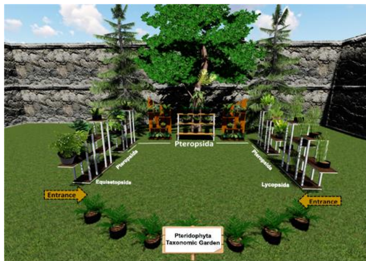
Figure 3. The PTLR model developed in this research

formulate the general characteristics of the Pteridophytes, compare the features of each class and analyse the phenetic relationships. The modified PTLR (Fig. 3) was then further validated.