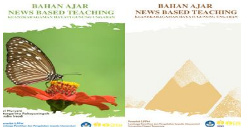
Figure 1. Teaching material covers, left: front cover and right: back cover

As mentioned before, the material content and media were initially validated. The results of the validation analysis of teaching materials by material experts and media experts are presented in Table 3.