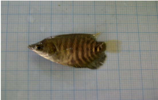
Figure 1. Gurami fish ( Osphronemus gouramy Lac.)

Gurami fish used in this study was 3 months old and came from a pair of parent spawning gurami. As many as 24 gurami is placed in the aquarium fiber 12 each with a density of 2 fish with an average weight of 2.62 \pm 0.64 g (Figure 1). Gurami were placed in the aquarium at random and in acclimation for one week, at the end of acclimation, fish were fasted for one day. Gurami fish, ready for treatment.