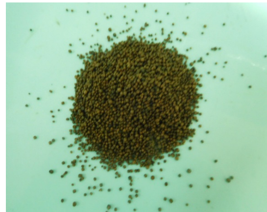
Figure 3. Feed supplementation S. platensis

The hematological data of gurami (number of erythrocyte, number of leukocyte, hemoglobin concentration and hematocrit value) were calculated at the end of the study. Blood was drawn from the heart using a 1 ml syringe that had been moistened with anti-coagulant (EDTA). Calculation of the total number of erythrocytes and leukocytes using haemocytometer "Improved Double Naubauer's", measurement of hemoglobin levels using haemometer "Assistant" and measurement of haematocrit value (Hct) by microhematocrit "Hawkskey haematocrit reader" (Chairlan & Lestari, 2011)