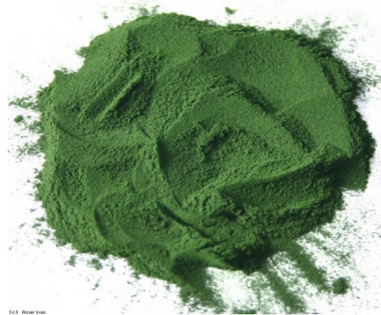
Figure 2. Spirulina platensis powder.

millimeter blocks paper while the body weight measurement was done using a digital scale with a precision of 0.01 g.