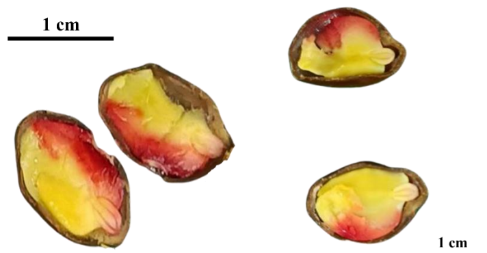
Figure 2. Two G. Assamica seeds display red coloring around the scarified location 24 hours post immersion in tetrazolium solution.

This research result also shows that scarified seeds produce significantly higher GSI values than unscarified seeds. The result indicated that the treatment enhanced the germination speed of G. assamica . This result follows Oliveira et al. (2017),