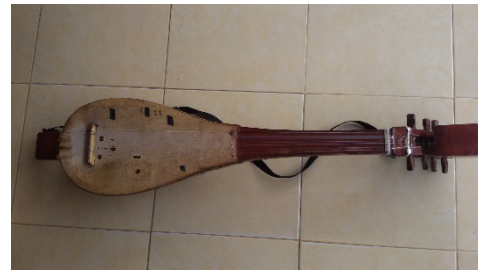
Figure 1. Gambus lunik (small)

musical instruments into the Lampung region—along with the influx of Islamic influence. The color of the music breathes Islamic while singing poetry. All of gambus players began in Arabic with accompaniment and poetry. In the Lampung region this artistry has various mentions, or terms, some refer to it as a gambus tunggal , a gitar tunggal , and some others call it a petting gambus .