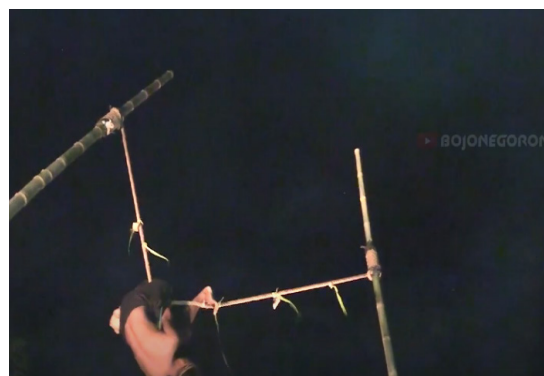
Figure 4. Kalongking Attractions (Action of Kalongking , according to public belief, moves because of the influence of supernatural beings)

The acrobatic attraction is performed with the eyes closed, climbing on the east bamboo pole and dancing in a bat-style movement which then hangs on to hook its legs on a rope with its head down and will descend on the west pole. All scenes shown through Kalongking represent every human being in the center ( pancer ) of life which is connected to the vertical pancer and horizontal pancer dimensions.