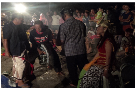
Figure 3. Jaranan Dance Scene ( Jaranan dance, according to people's beliefs, moves because of the influence of supernatural beings)

When the Jaranan dance scene begins to be presented, a series of songs are sung, which is believed to be a form of offering to mediate with spirit energy ( ndadi ). For example, the Jaranan dance scene ( Mbesa ) is accompanied by the song Kembang Le Li Le Lo Gempol , and then the Jaranan begins to circle the outside arena ( Mubeng Blabar ) accompanied by the Kembang Johar song, which serves to limit the pressure of the audience from the sacred arena. Next is the Jalok Ngombe in Jaranan scene accompanied by the song Kambang Jambe and the Jalok Leren scene accompanied by the Kembang Duren song. While releasing energy (awareness), the Jaranan players are accompanied by the song Kembang Jambu which means Jaranan asks for sleep.