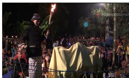
Figure 4. Pimp Nggundhisi scene ( Mendalang tells of the descent of the holy spirit "goddess" totaling 44 down to earth)

All the role players entered the arena stage accompanied by the song Kambang Otok with their heads covered with cloth, guided by makeup artists who carried torches as a guide to enter the arena. Then the torch was handed over to Pimp to circle Blabar Janur Kuning in a clockwise direction until he reached the north side facing east. In the next scene, Pimp starts Nggundhisi , the mastermind, who tells of the descent of 44 female holy spirits (goddesses) down to earth. Some are believed to have any involvement in shaping the characters in Sandur , becoming a kind of incarnation, or possessing the bodies of Sandur's role players. Among them is the incarnation of a goddess named Wilutomo , who entered the body of Pethak , Drustonolo entered the body of the Balong character, Gagar Mayang entered the body of Tangsil , and Suprobo entered the body of the Cawik figure. The incarnation of Irim-irim possessed Pimp , Panjak Ore , Panjak Kendhang , Panjak Gong , Kalongking , Craftsman Njaran , and other figures. The characters of the goddesses are believed to be incarnated in the body of the role players. This performance relates to the characters in the epics Ramayana and Mahabharata , which are often performed in wayang stories.