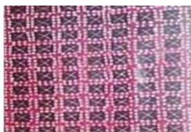
Figure 7. Examples of Magel Ati Motif