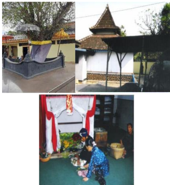
Figure 4. Tree for Ritual Offerings in front of the Mosque

He took the example of the druju flower, which grows a lot in the Juana area near the Bengawan Silugonngo river, which is a fairly large river in Juana.