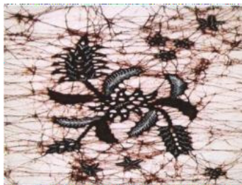
Figure 3. Examples of Druju Flower Motif

Besides the motifs developed by the community of Bakaran village batik craftsmen, craftsmen believe several batik motifs are believed to be from generation to generation and strongly believed in the motifs created by the legendary figure Nyai Ageng Danowati, a batik craftsman from the Majapahit kingdom who fled to the Juana area in particular in the village of Bakaran Wetan. Around the 14 th century AD. The motifs of the legend are: