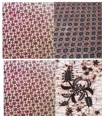
Figure 2. Examples of Some Bakaran Batik Motifs

The Bakaran batik motif has many patterns, according to the legend of Nyai Ageng Danowati. The batik motifs (Figure 2) can be exemplified in Figure 2