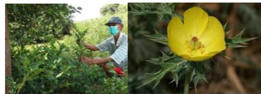
Figure 1. Druju Tree and Druju Flower growing on the riverside

After arriving in the Druju forest, Nyai Ageng Danowati and her siblings cleared the forest and bushes to make their temporary residence. Finally, they separated, and Nyai Ageng Danowati resided in the Bakaran Village, Juana District. Even then, because of an agreement that Nyai Ageng Danowati could live according to the ashes that were blown by the wind to the west from the Druju forest, which is now called the Bakaran Village, the word Bakaran Village is derived from the words of burnt wood and leaves and twigs Druju forest (Figure 1).