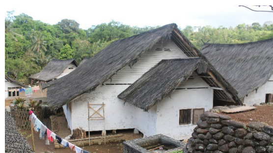
Figure 1. The housing pattern of Kampung Naga

The houses are the house on stilts with space beneath the house functions as chicken or duck coop, or as an agricultural tool and firewood storage. Kampung Naga residents call the house as they call themselves as the house has a head, body, and legs. The houses in Kampung Naga basically have the same basic pattern, arranged lined extending from west to east, rectangular in length and face to face. The function of the house that facing each other is to make the residents pay attention and communicate with each other s, in accordance with their lifestyle that is to hold togetherness and have a family life (Nurjanah et al, 2013).