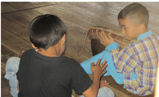
Figure 5. Two children of Kampung Naga are exploring how to beat Terebang

The concept of Nu dirampa allows children to experience directly and allow them to explore. Let the children know about the instruments they hold and explore the sounds through musical instruments. So the concept of nu deprived is a teaching that fosters the desire, curiosity, intentions and conscience of children.