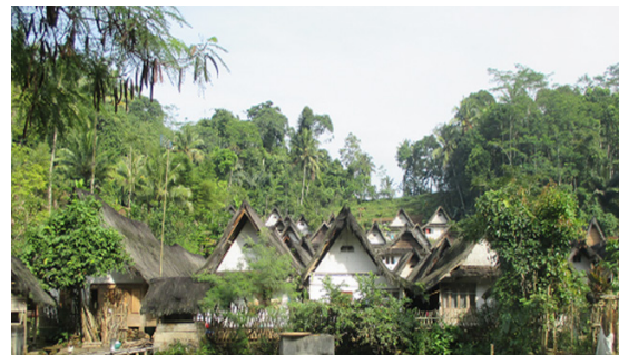
Figure 2. The Atmosphere of Kampung Naga.

Basically, those who live outside Kampung Naga are still bound by the village custom and are still recognized as part of their community. So in every ceremony of the traditional ceremonies, they come to Kampung Naga to make pilgrimages to the sacred tombs that are considered as the graves of their ancestors. However, for those who live outside Kampung Naga, they are not bound by the terms and conditions to make the house on stilts and other rules (Nurjanah et al, 2013).